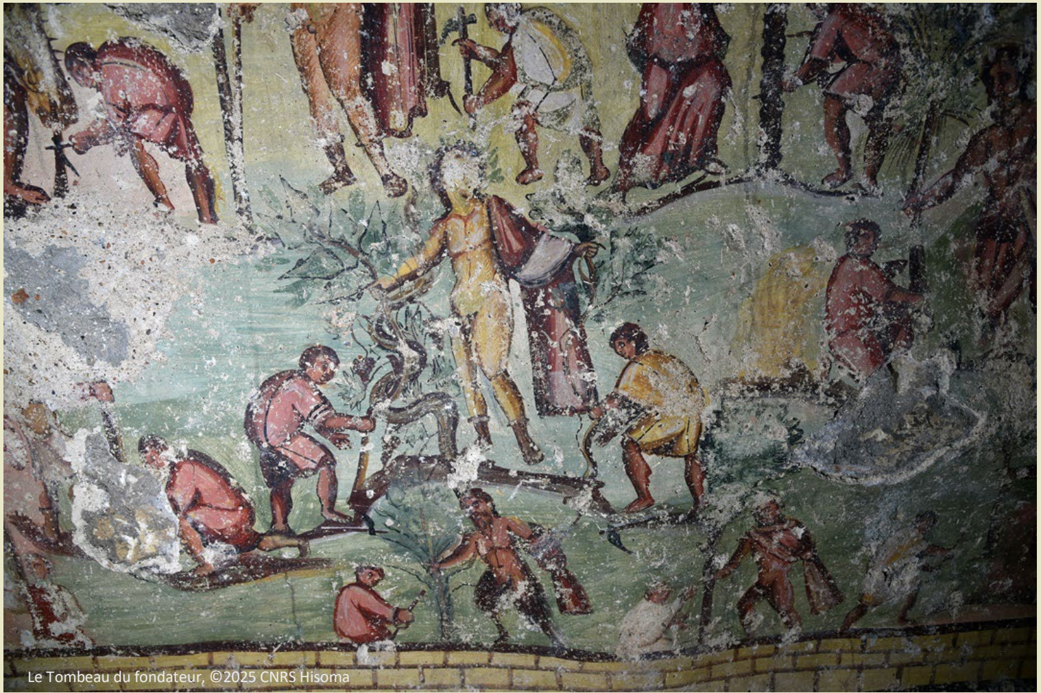
Le Tombeau du fondateur

The Biannual Martin P. Nilsson Lecture on Ancient Greek Religion